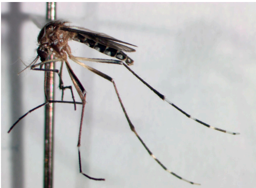
Aedes Aegypti, Female