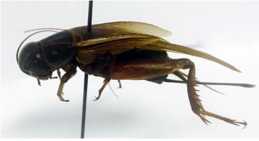
Cricket - Field