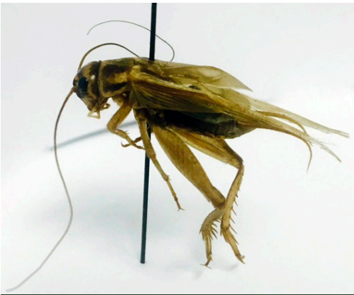
Cricket - House

Crickets are a common household invader. They spend most of their life outside where they feed, and reproduce. They can wander indoors and become a noisy nuisance during late summer and early fall. Crickets have a characteristic chirping sound that most males make to attract a female mate. Chirping sounds are created by stridulation. A file-like structure is located on the edge of the large vein that runs down the center of the forewing, and a scraper is located on the end of the forewing. The cricket rasps the two structures together rhythmically, and the sound is resonated and amplified by a 'harp,' which is the heavily sclerotized, center part of the forewing 42 . The sound is fairly loud, and attracts females. Several different songs are used in some species of crickets to deter other males, call, mate, and celebrate mating. Cricket chirping can also be used as a tool to determine what temperature it is. The rate of chirping can increase at higher temperatures, and decrease at lower temperatures 42 .